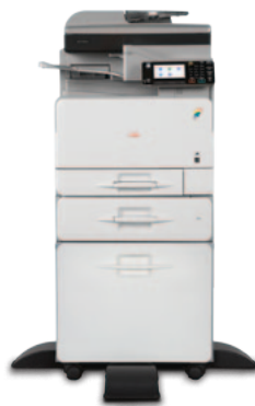
MP C305 with optional PB1050 Paper Tray