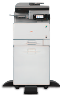
MP C305 with one bin tray

Some features may require additional options.