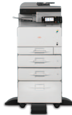
MP C305 with two optional PB1050 Paper Trays