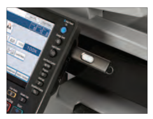
A USB Type A port is conveniently located in the control panel for quick and easy printing from/scanning to removable media.